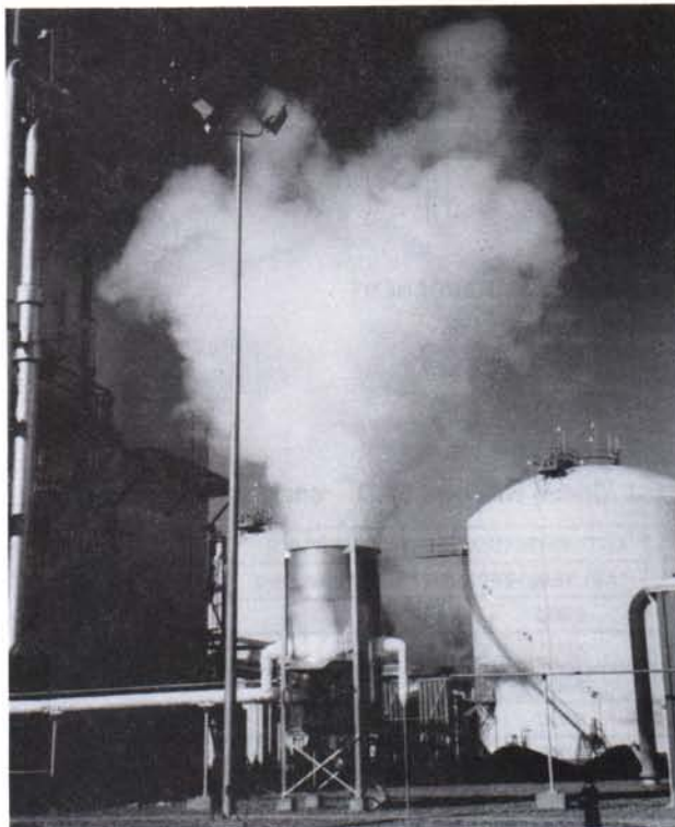
Thermax FAD 250 on 55,000 lb/HR O 2 N 2 capacity at exit temp 50° below air temp using 30 hp fan

Thermax also offers Cold Water (Datasheet 7.0) and Steam (Datasheet 5.0) Heated Disposal Vaporizers.