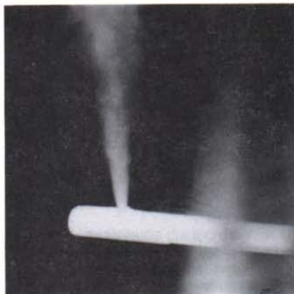
Actual Thermax injector test with liquid nitrogen